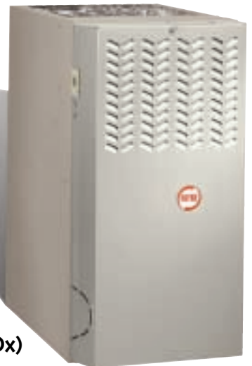
Models PG8M / PG8J (Low NOx)

No matter which model you choose, you can expect comfort and savings to continue for years because Payne products are designed, built and tested for long lasting operation.